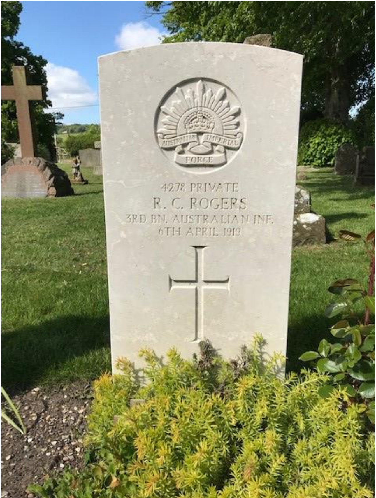
Photo of Private R. C. Rogers' Commonwealth War Graves Commission Headstone in St Lawrence's Churchyard, Stratford-sub-Castle, Wiltshire, England.