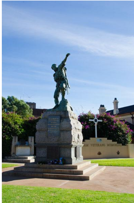
Broken Hill War Memorial